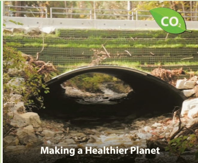
Making a Healthier Planet

Sustainability is integral to our business. Plus, it's the right thing to do.