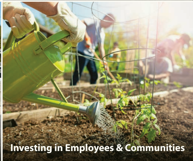
Investing in Employees & Communities